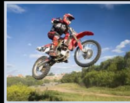
Dirt & Track Racing