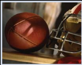
College & Pro Football

Professional Athletes Disability Insurance is designed to guarantee the benefits of the athlete's contract, their current income, or protection for young players before being drafted into the professional leagues. Many sports do not guarantee the benefits to the player for longer than the current contract year. If the player is injured and is not able to make the cut during the pre-season their contract may be waived. Petersen International Underwriters offers benefits that are structured based on the players contract or their income and the type of sport.