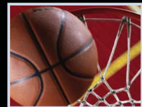
USA & European Basketball