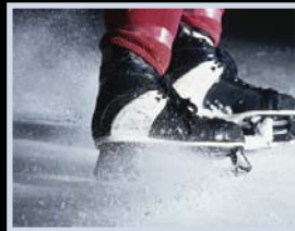
USA & Canadian Hockey