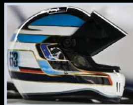
Stock Car & Open Wheel Racing