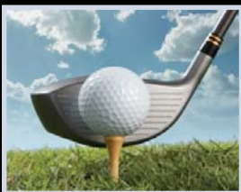
Pro & Senior Golf